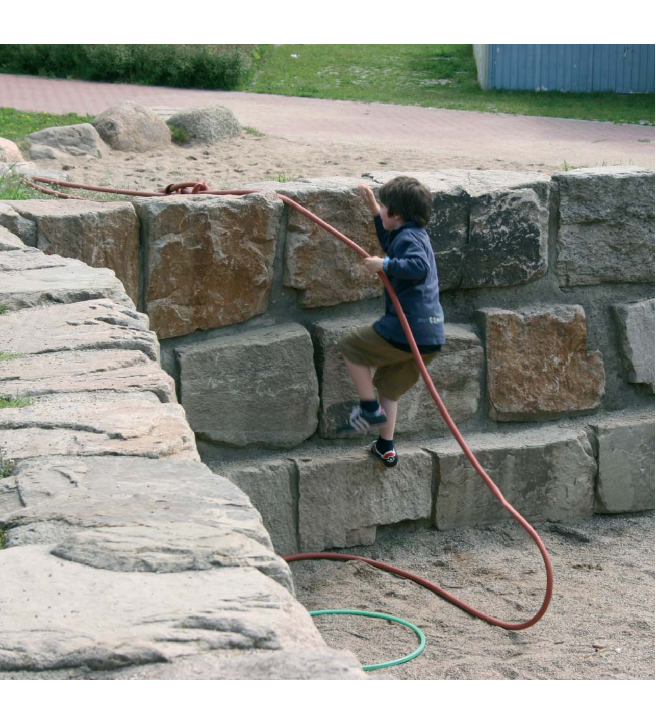
A school playground in Berlin which gives children the chance to challenge their abilities.